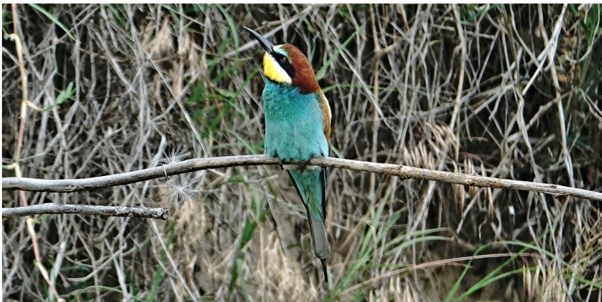
European Bee-eater