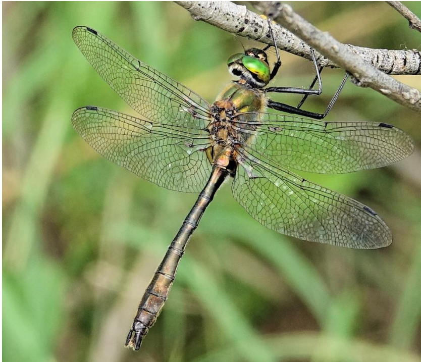
Downy Emerald

of Spain and Lesser Spotted Fritillaries and a bonus Tufted Marbled Skipper. The group also made the most of the opportunities to study the dragonflies and we tallied 17 species including Southern Darter, Downy and Yellow-spotted Emeralds and Southern Emerald Damselfly.