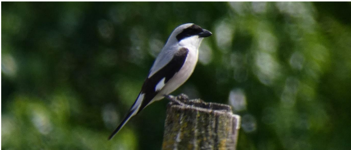
Lesser Grey Shrike

With time marching on, my thoughts had already turned to lunch, but Gábor had two species up his sleeve! First, we stopped at a spot where a pair of Lesser Grey Shrikes was nesting. We had superb views of an adult perched on a post then a bale, one of the 'must-see' birds on this tour safely ticked off in style.