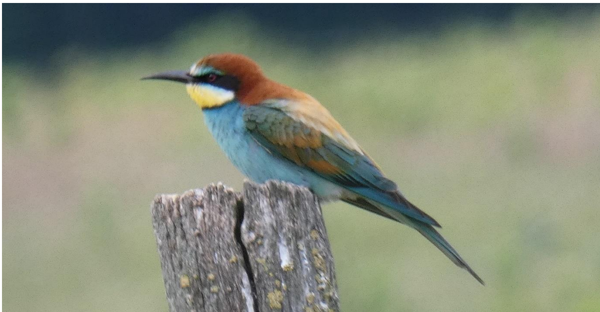
European Bee-eater

With pleasant temperatures and minimal heat haze, it was an ideal place to scan over the forest. Our timing was perfect as, almost at once, we found a pair of Eastern Imperial Eagles with the birds soaring for ages allowing everyone repeated scope views of this Globally Threatened species.