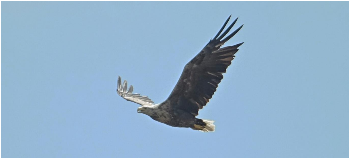
White-tailed Eagle

the resident pair noted again on 13 June. We watched another pair from the Hosszúhát 'hill' on 8 June.