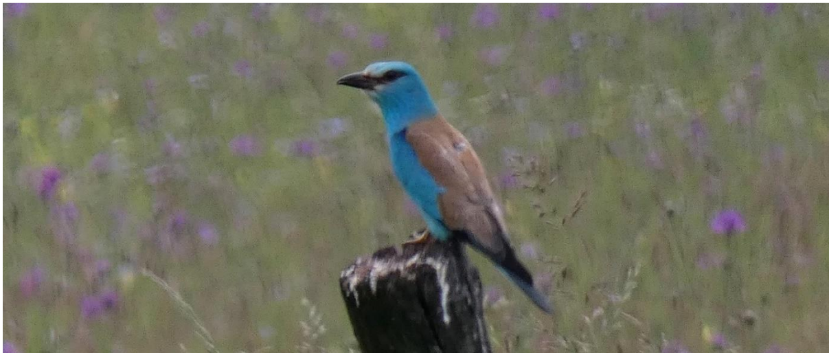
European Roller

Tawny Pipit plus more point-blank Bee-eaters and Rollers. A Wheatear at its usual spot proved remarkably elusive.