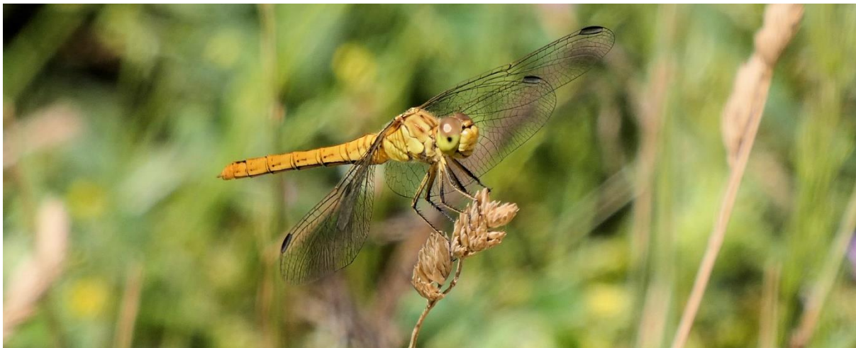
Southern Darter

Next, Gábor took us to a Bee-eater 'wall' where, using the minibus as a hide, we had incredible views as the birds perched up and flew around in the vicinity of their nest holes; it was wonderful to hear the liquid calls as well as enjoy the views. Satiated, we headed off, but in fact we paused again moments later as an Icterine Warbler was in song. The bird wasn't keen to show itself, but most of us saw it in flight, and as a bonus, we found our first Southern Darter, with our photos good enough to show why it was Southern rather than Common.