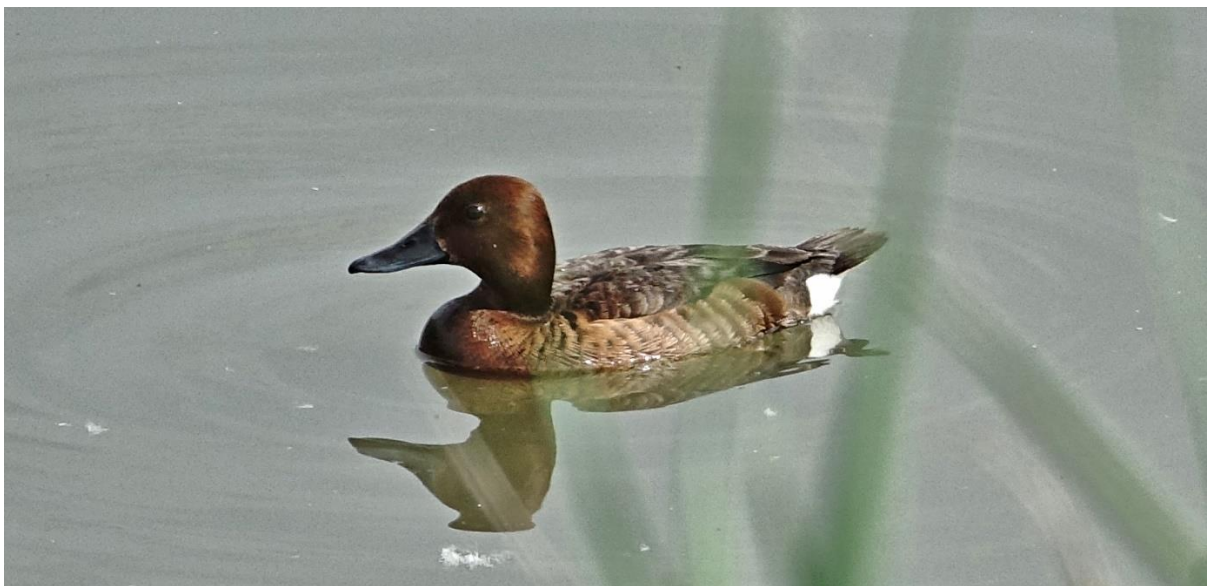
Ferruginous Duck © Jeremy Aldred

An impressive count of c.30 at Apaj fishponds (8 June).