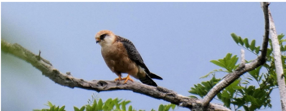
Red-footed Falcon (female)

Having returned to the copse and reedy pools, we walked to a spot giving us extra elevation. On the water we found a drake Garganey, as well as Shoveler and Teal and had super views of more Black-winged Stilts. A group of Wood Sandpipers called and dropped in. The main attraction here was Whiskered Tern with large numbers feeding in front of us; the Black Tern we spotted amongst them was incidental really.