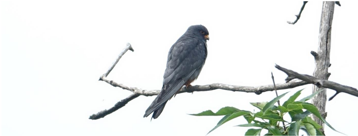
Red-footed Falcon