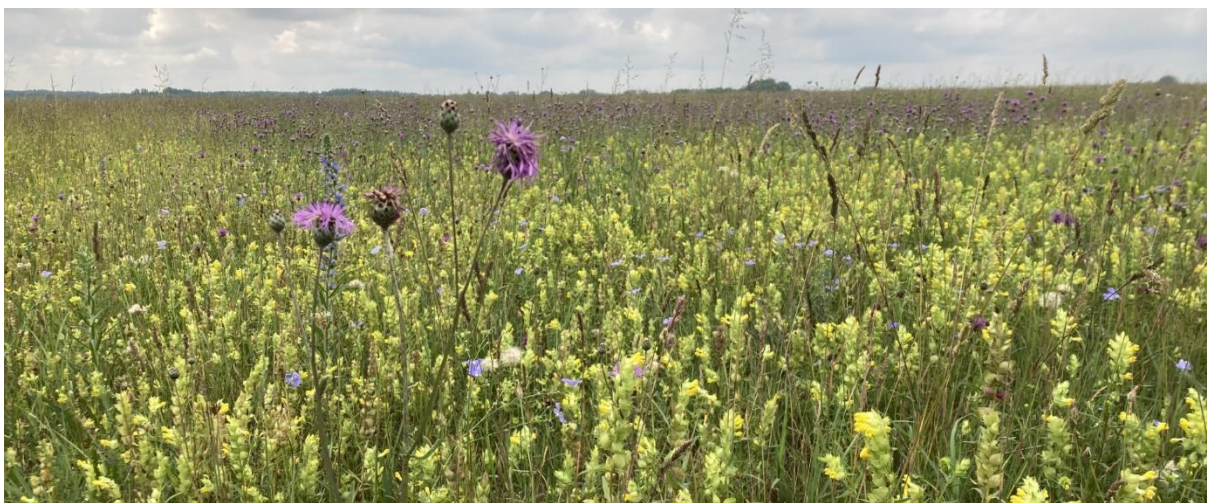
A wildflower field dominated by Yellow Rattle

Cream-spot Tiger Arctia villica Marbled Clover Heliothis virescens Hummingbird Hawkmoth Macroglossum stellatarum Nine-spotted Amata phegea