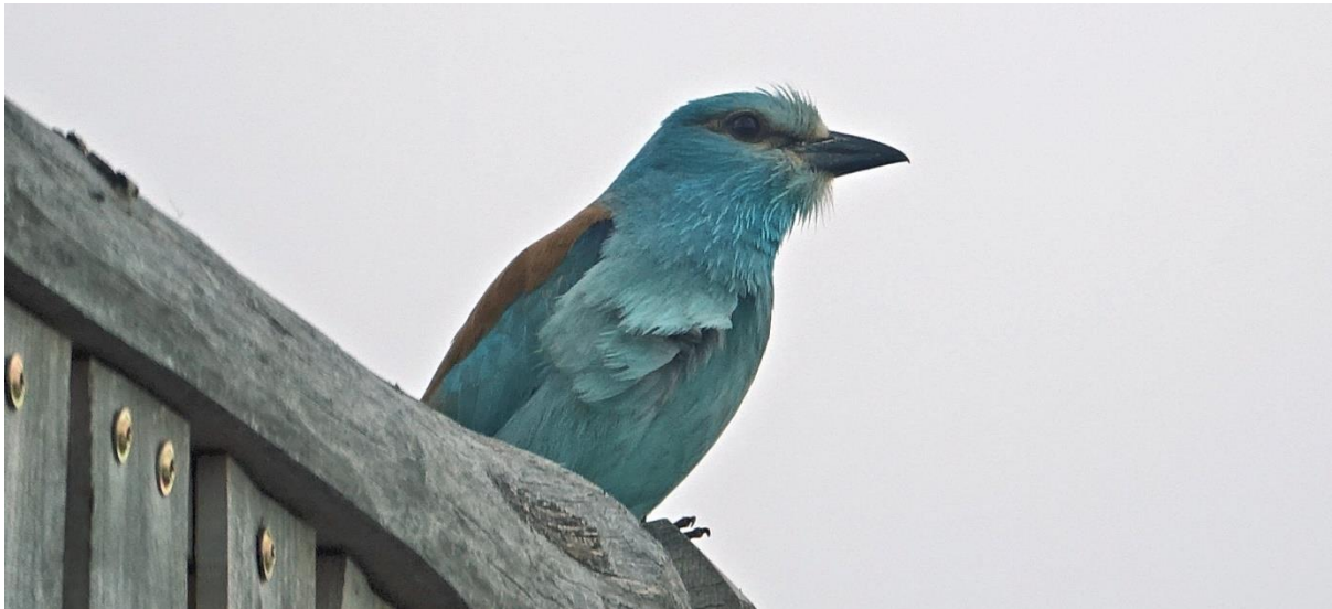
European Roller

towards the end of our stay. Elsewhere, we noted a small number on the Kunpuszta on both visits and had occasional sightings elsewhere.