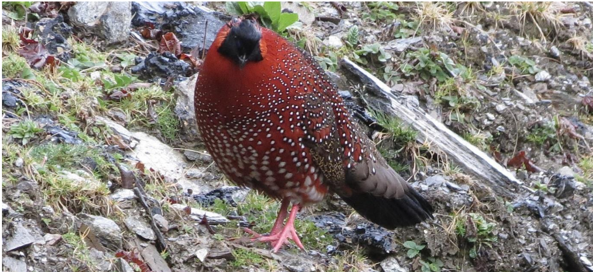
Satyr Tragopan

On 4 May, we saw a female in the Shingar Valley and we heard one the following day on the way to Tharpaling.