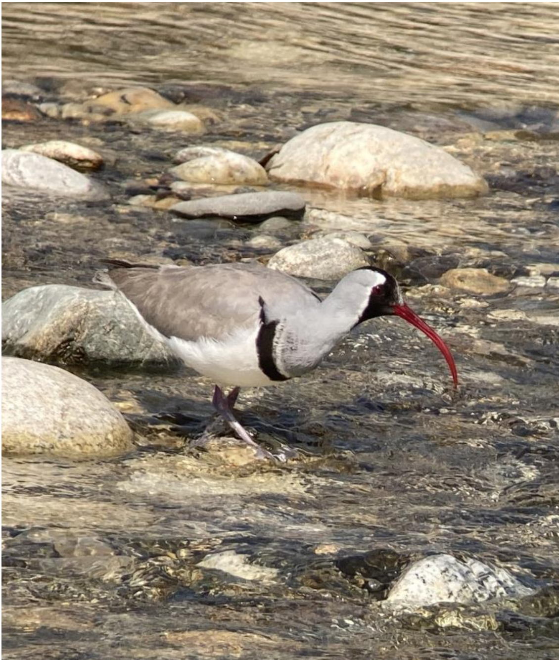
Great views of Ibisbill was one of the major highlights of our trip to Bhutan