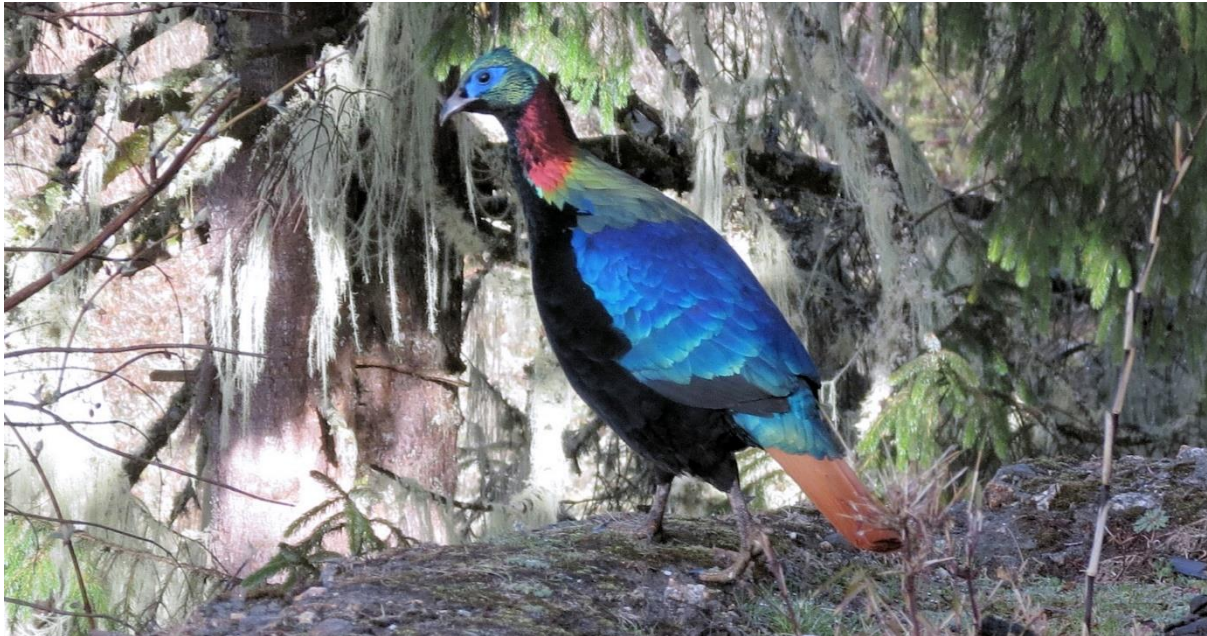
Himalayan Monal

After seeing a couple at Chele La and three at Selthang La (all from the bus), we enjoyed splendid views of this huge pheasant at Tharpaling Monastery on 7 May, where several were seen.