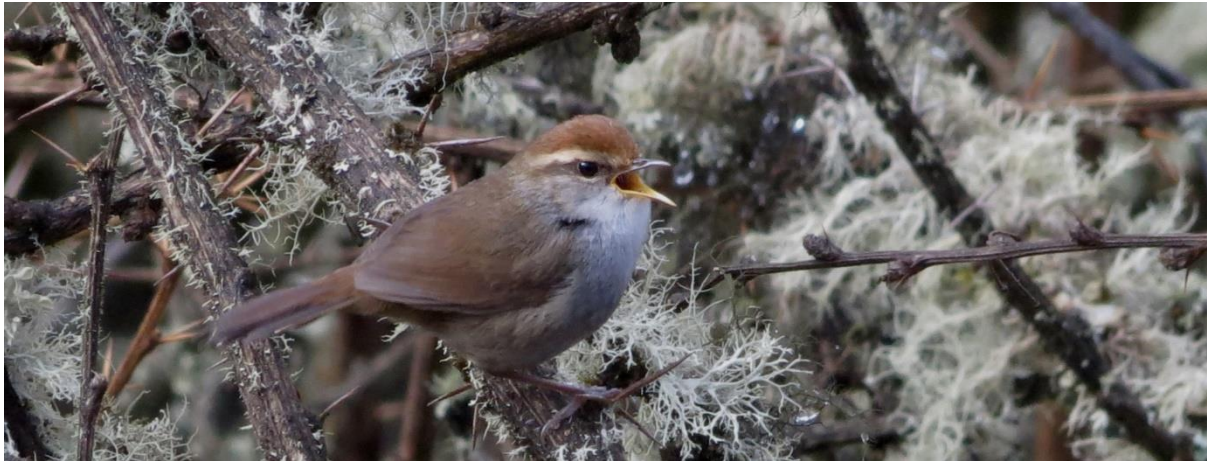
Grey-sided Bush Warbler