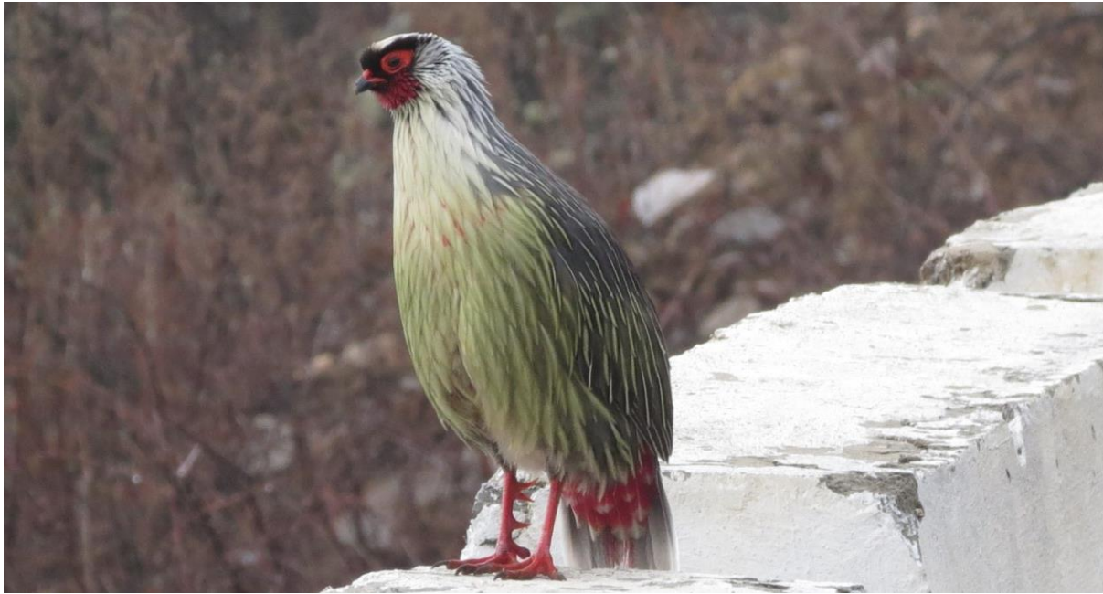
Blood Pheasant © Colin Bushell