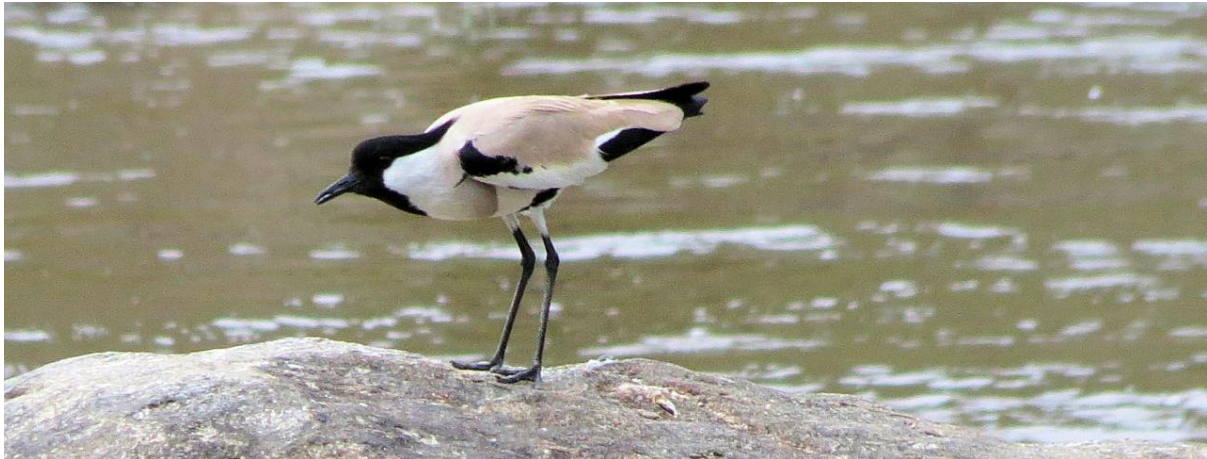
River Lapwing