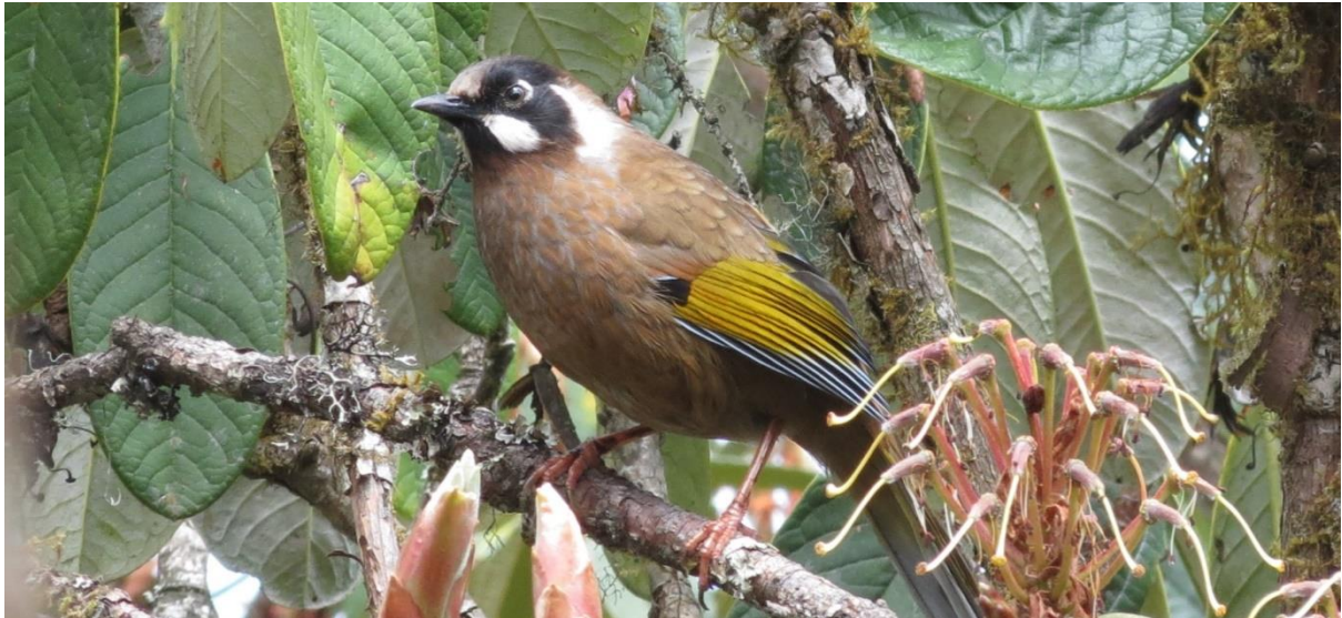
Black-faced Laughingthrush