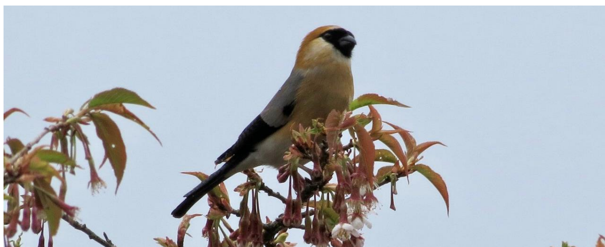
Red-headed Bullfinch © Colin Bushell

Found at Selthang La and Pele La where at least four birds gave us plenty of opportunities to study this attractive species.