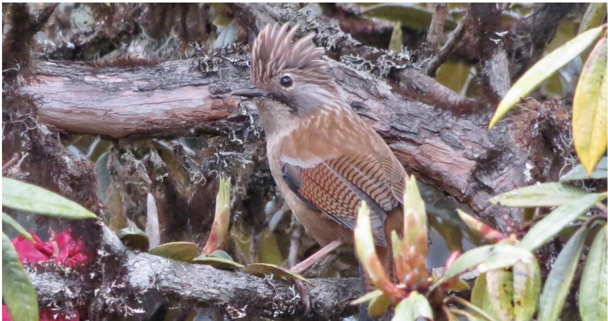
Hoary-throated Barwing

Seen on two dates around Yongkola and Pele La.