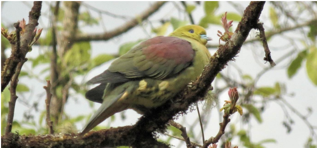
Wedge-tailed Green Pigeon

Found throughout the temperate zone and foothills, being the commonest Treron in Bhutan. Three were seen on 30 April in the Punakha Valley, then there were several days without seeing this attractive species, until we neared Punakha again. We saw them on 6 May on the way to Ngala and 8 May near Lumitsawa.