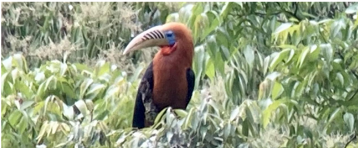
Rufous-necked Hornbill

Seen well on three days in the Yongkola area, with two seen on 2 May.