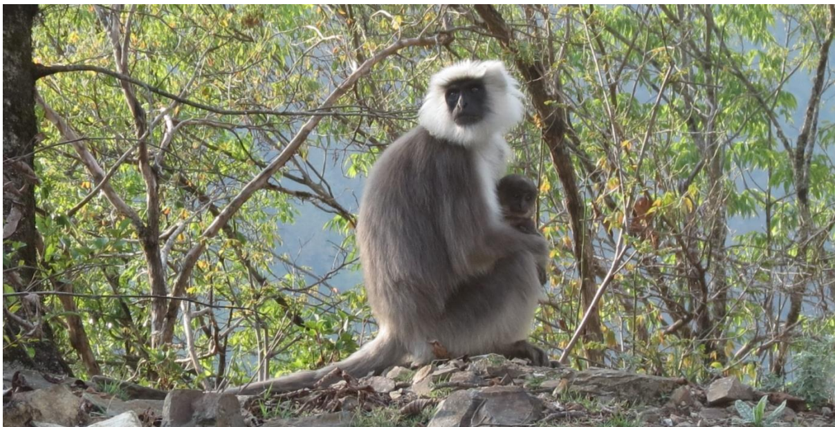
Grey Langur

Seen on 30 April and 6 May between Punakha and Pele La.