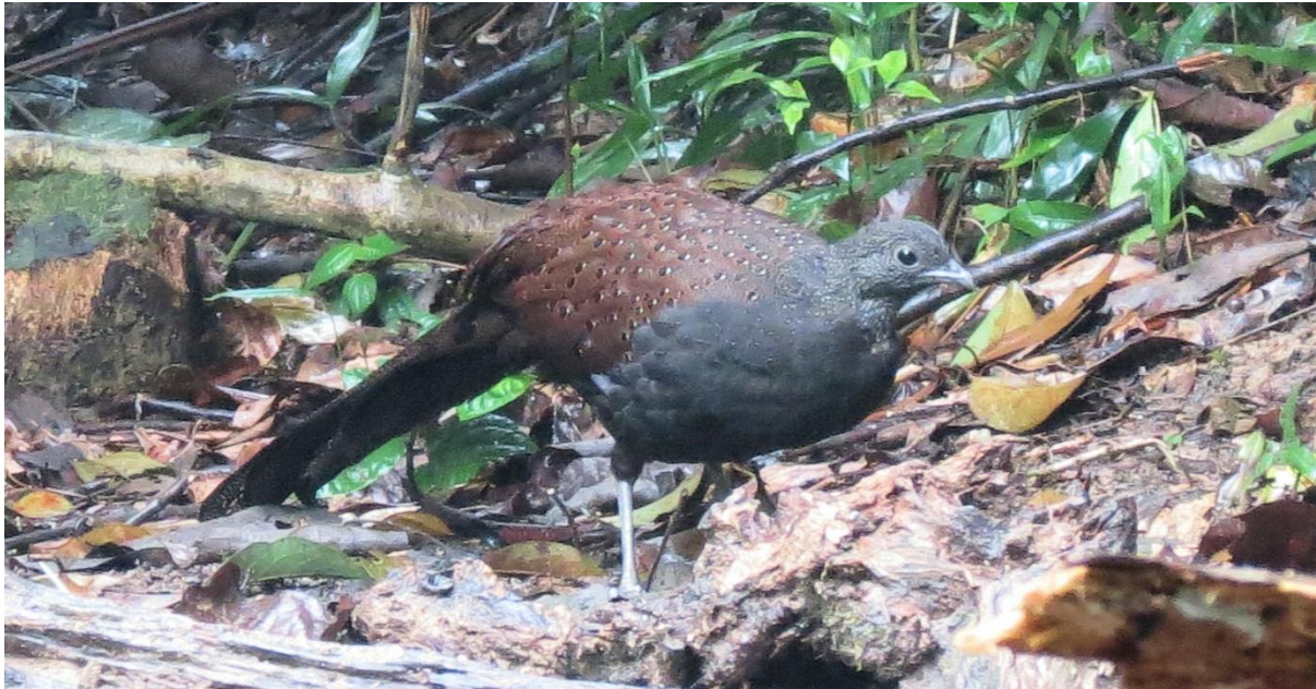
Mountain Peacock-pheasant

Great Argus Argusianus argus H Heard on two dates at Taman Negara, but always in the distance.