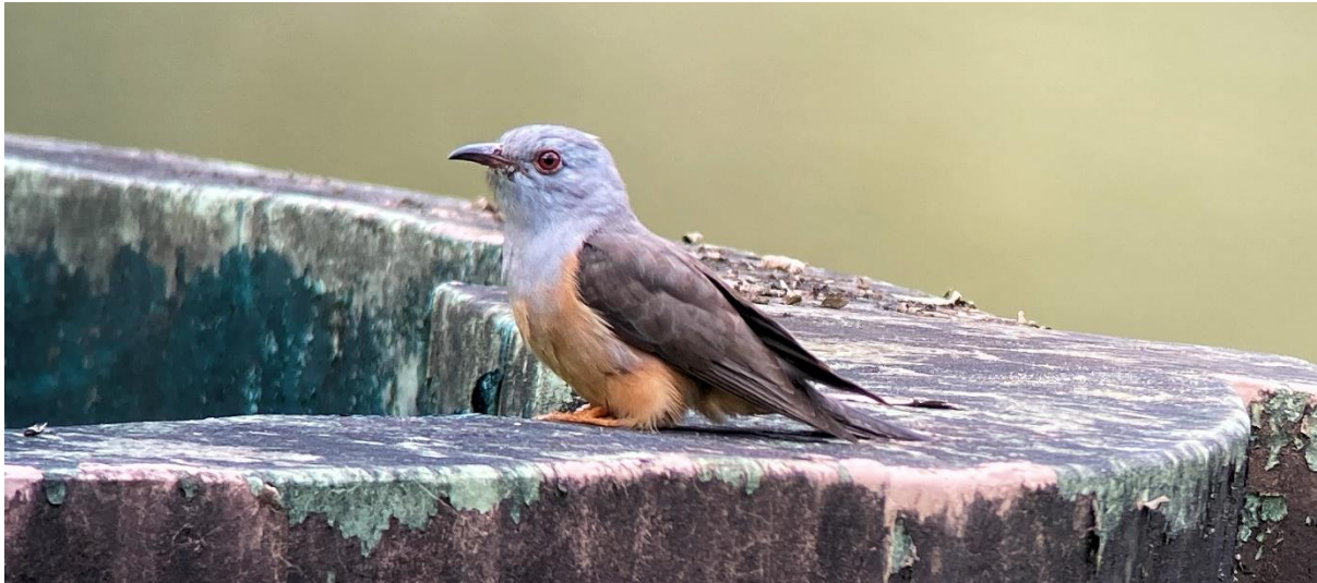
Plaintive Cuckoo © Colin Bushell

Plaintive Cuckoo Cacomantis merulinus Seen at Shah Alam Botanical Gardens 14/2 and Taman Negara 20/2, where it was also heard daily.