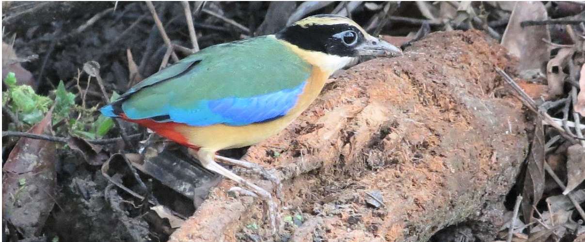
Blue-winged Pitta

Garnet Pitta Erythropitta granatina Pittas are, of course, among the most desired birds on this tour. We were lucky to enjoy great 'scope views of one of these, singing away from a perch and through the 'scope! We had to work a little, but Lee and Azmil located one on our second attempt along the Blau Trail, Taman Negara 21/2. We also heard one in the same area the following afternoon.