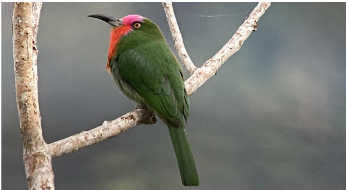
Red-bearded Bee-eater at Fraser's Hill

Oriental Dwarf Kingfisher Ceyx erithaca Recorded on three dates at Taman Negara. After a couple of frustrating days, hearing it only, we finally saw one along the Blau Trail, where we enjoyed prolonged views.