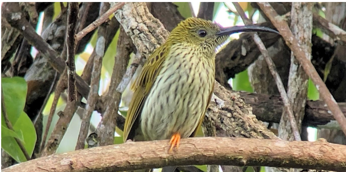
Streaked Spiderhunter © Colin Bushell

Streaked Spiderhunter Arachnothera magna Seen daily around Fraser's Hill, where we enjoyed great 'scope views.