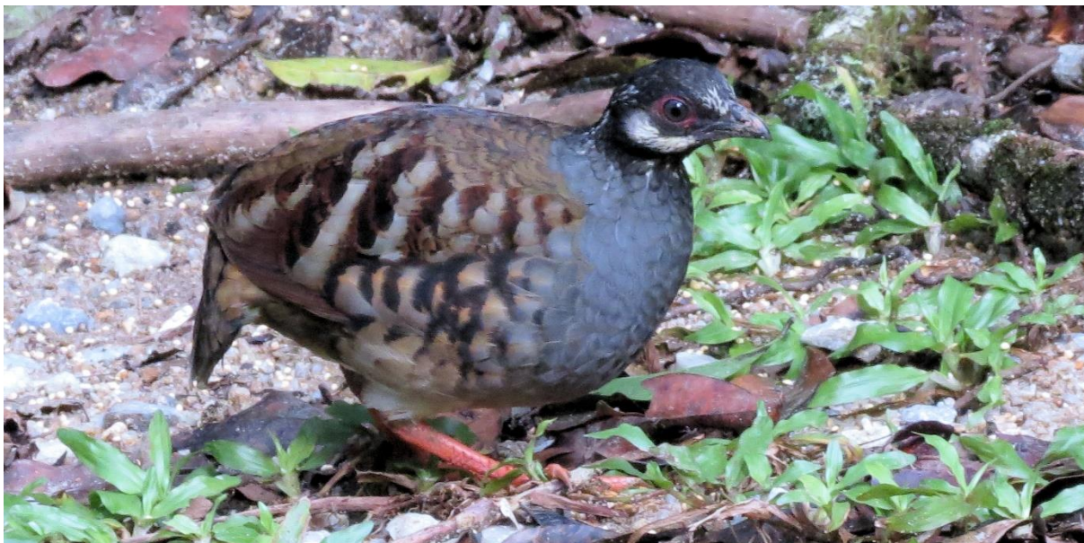
Malayan Partridge at the Richmond Road feeding station © Colin Bushell

Crested Partridge Rollulus rouloul H Heard along the Blau Trail, Taman Negara 21/2.