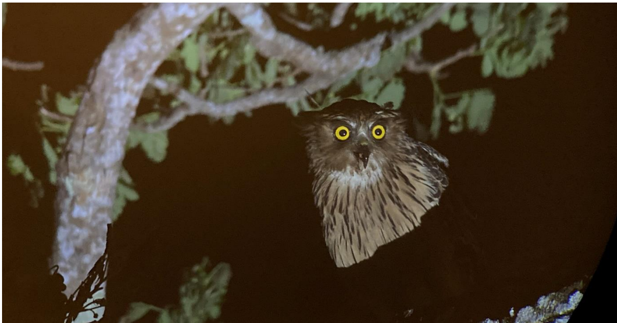
Buffy Fish Owl at Kuala Selangor

Buffy Fish Owl Ketupa ketupa One seen extremely well near our hotel at Kuala Selangor 14/2 and another in daylight along the Tehan 22/2 at Taman Negara. A well deserved 'top 5 bird' for some.