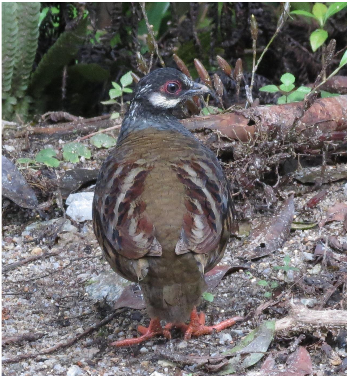
Malayan Partridge – one of the highlights of our trip to Peninsula Malaysia