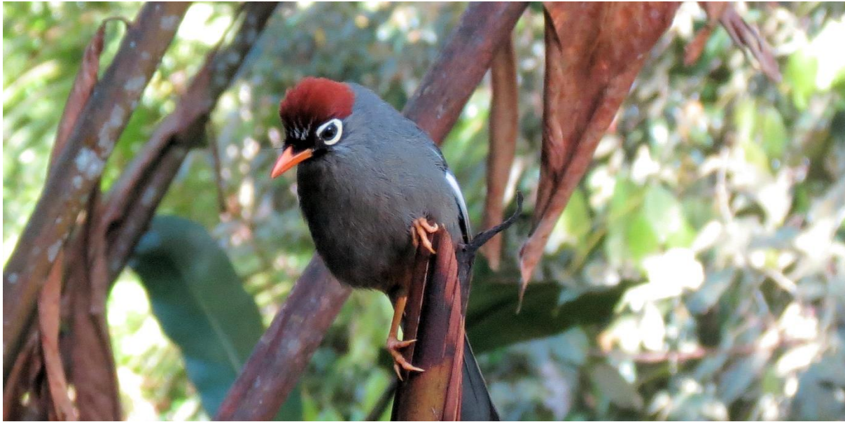
Chestnut-capped Laughingthrush

Asian Fairy-bluebird Irena puella Our first were seen at Fraser's Hill, but sightings became more frequent as we descended from Bukit Tinggi to Taman Negara, where we found them in most cleared areas.