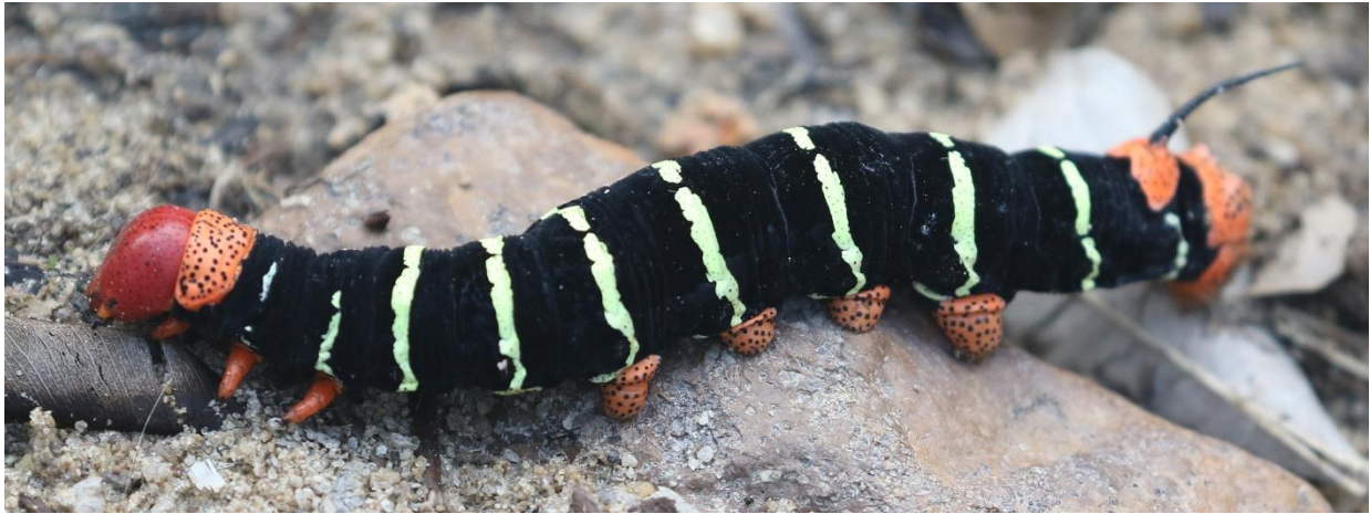
Sphinx Moth caterpillar

On 31 August we saw the caterpillar of a Sphinx Moth during the landing at Novo Airão.