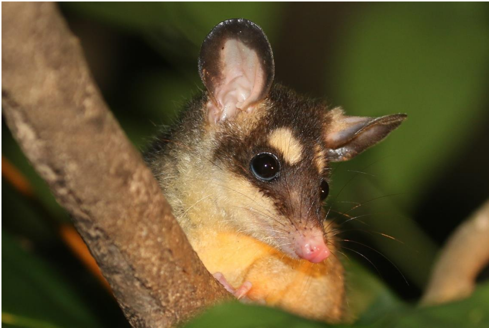
Grey Four-eyed Opossum

We had some fantastic views of one of these opossums whilst spotlighting on 30 August.